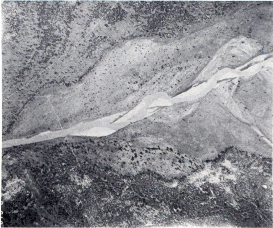
FIG. 1.—Aerial photograph of part of Sengwa Wildlife Research Area.