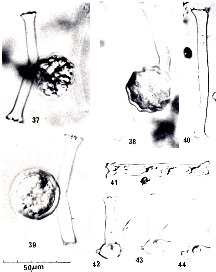
FIGS 37-44.—Photomicrographs of Triplastrum spinulosum . 37, immature zygospore showing crenate margin; 38, 39, mature zygospores; 40, asymmetrical cell; 41, anomalous cell with one polar lobe in each semicell under-developed, without spines and slightly subapical; 42-44, anomalous semicell with a prominent basal inflation encircled by a whorl of eight lobes, photographed at various focussing adjustments.