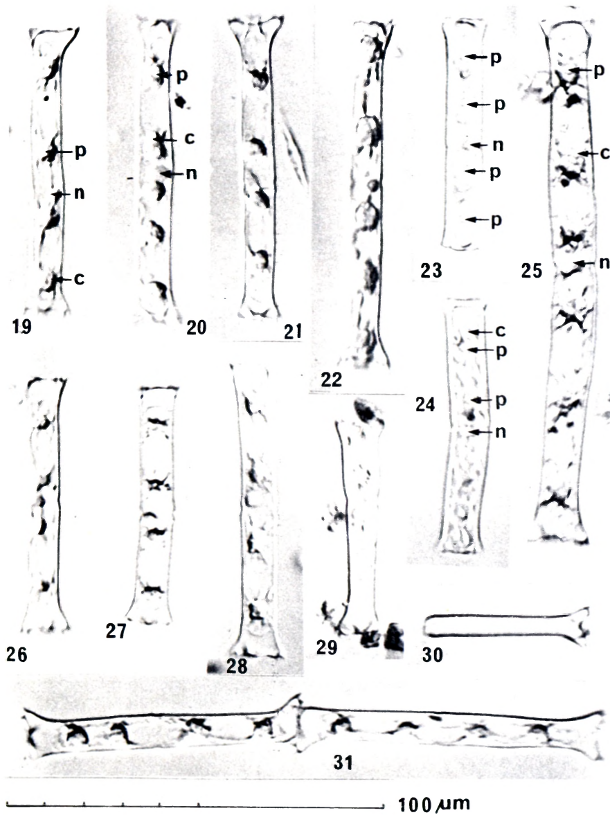
FIGS 19–31.—Photomicrographs of Triplastrum spinulosum . 19, 21, cells with three-lobed apices and two chloroplasts per semicell; 20, 22, cells with three-lobed apices, one semicell with two chloroplasts and the other semicell with three; 23, 24, cells with four-lobed apices; 25, large specimen with four-lobed apices and each semicell with three chloroplasts; 26–28, cells each with the upper apex four-lobed and the lower apex three-lobed; 29, asymmetrical cell with upper semicell broader than lower semicell; 30, abnormally narrow semicell; 31, two cells after division remaining attached to each other. (c, chloroplast; p, pyrenoid; n, nucleus).