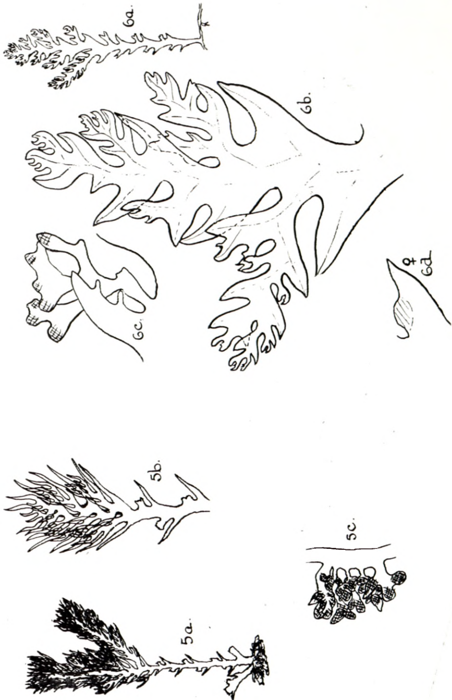
FIG. 5 and 6. Fig. 5.— Plocamium cornutum (Turn.) Harv.: (a) Portion of a well-developed plant, \times 1 ; (b) portion of plant in detail, \times 2 ; (c) sporophylls as modified pinnules, \times 40 . FIG. 6.— Plocamium suhrii Kütz.: (a) Portion of a well-developed plant, \times 1 ; (b) portion of plant in detail, \times 10 ; (c) axillary sporophylls \times 50 ; (d) marginal, sessile cystocarp, \times 10 .