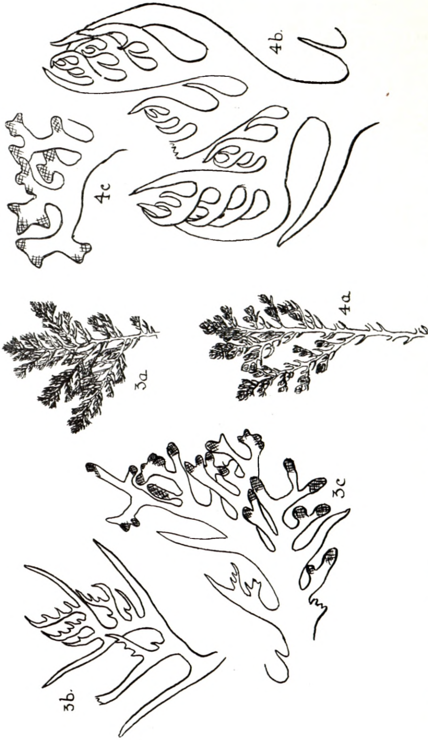
FIG. 3 and 4. Fig. 3.— Plocamium beckeri Simons: (a) portion of a well-developed plant, \times 1 ; (b) portion of plant in detail, \times 15 ; (c) sporophylls as modified pinnules, \times 30