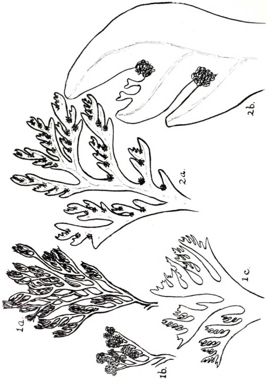
FIG. 1 and 2. Fig. 1.— Plocamium glomeratum J. Ag.: (a) Portion of a well-developed plant, \times 2 ; (b) portion of a fertile plant showing sporophores, \times 4 ; (c) portion of plant in detail, \times 15 .