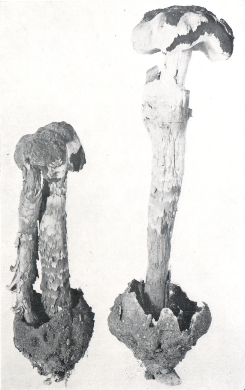
FIG. 4.— Battarea stevenii \times 1/2 .