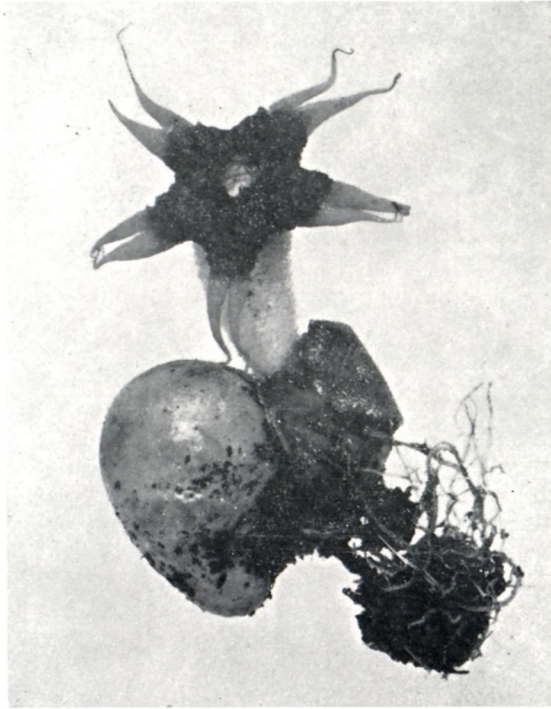
Above: FIG. 2.— Chlamydopus meyenianus \times 1.