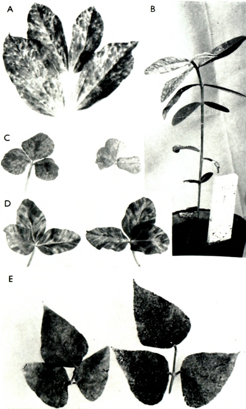
FIG. 1.—BROAD BEAN MOSAIC VIRUS A.

A. Vicia faba —showing depressed chlorotic areas. B. Crotalaria juncea . C. Trifolium incarnatum . D. Trifolium pratense . E. Phaseolus lunatus .