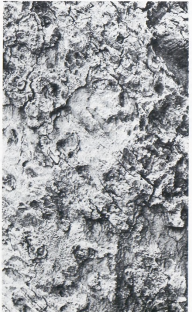
FIG. 2.—The variant of Acacia sieberana var. woodii with non-peeling bark.