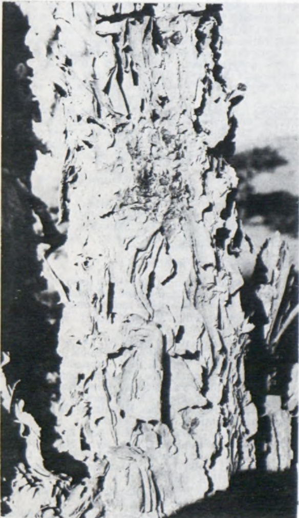
FIG. 1.—The typical papery, peeling bark of Acacia sieberana var. woodii .

Although one of the distinguishing characters of subsp. sieberana (which included var. orientale ) was the presence of long persistent spines, examination of the holotype and two isotypes of var. orientale revealed that the holotype and one isotype are devoid of spines while on the other isotype the longest spines are only 0.5 cm long. None of the morphological characters held to typify var. orientale is peculiar to this variety alone; all of the characters may be found in numerous specimens in East, Central and Southern Africa. Variety orientale , which has no real distinguishing characters, is best regarded as a local variant or ecotype and, when viewed in relation to the range of variation within the species throughout its range, cannot be upheld. Var. orientale is likewise reduced to synonymy under var. woodii .