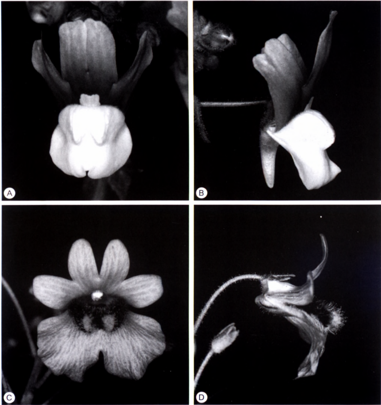
FIGURE 2.— Nemesia flowers: A, B, N. suaveolens : front and side views; C, D, N. aurantia : front and side views.

that species by having a lower lip that is yellow rather than white with pale violet margins, an upper lip with a conspicuous yellow rectangular patch, just above the corolla opening, a spur that is ± equal to the length of the lower lip, not half the length of the lower lip, and a hypochile that is yellow rather than dark violet. Schlechter (1899) and Hiern (1904) describe the lower lip of N. euryceras as sulphur yellow, but this is apparently based on a single flower on the type specimen ( Schlechter 8126 at K) that became yellowish from drying. The other flowers on the same plant do not look yellowish, but rather are consistent with the author’s observation at the type locality ( Steiner 3686 at NBG) of a lower lip that is white with pale violet margins. Other collections in PRE from the type locality and nearby areas also give