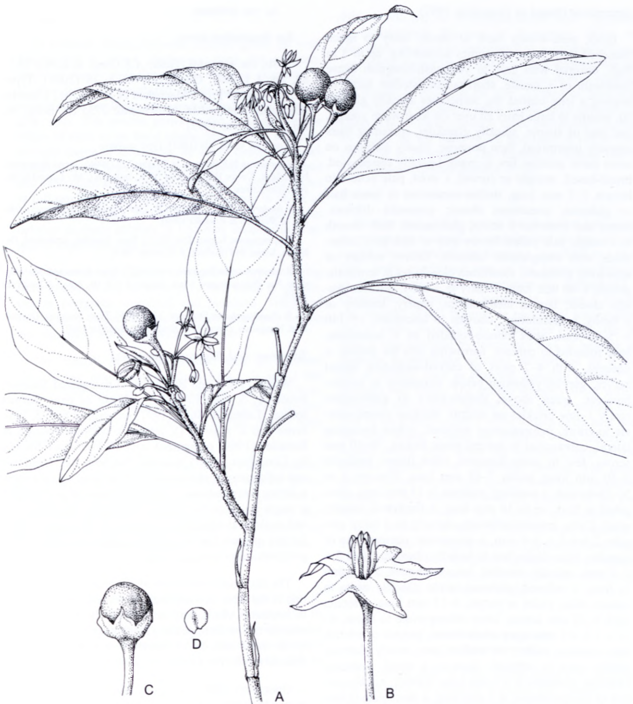
FIGURE 2.— Solanum goetzei , A–D, M.C. Ward 1328 (PRE); C.J. Ward 3840 (PRE). A, habit, \times 1 ; B, flower, \times 3 ; C, fruit, \times 1.5 ; D, seed, \times 1.5 . Artist: G. Condy.

roads. In South Africa it grows on well-drained sandy soil at forest margins, in clearings and along forest paths, also in woodland, in deep as well as light shade, from about sea level to 100 m altitude. In KwaZulu-Natal, flowering and fruiting material have been collected from November to May.