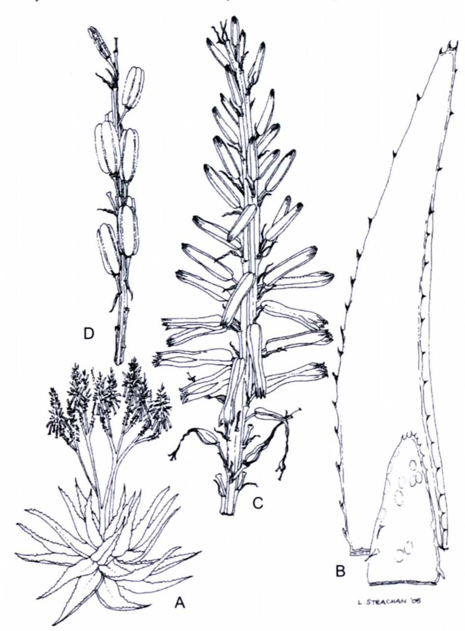
FIGURE 11.—Aloe kaokoensis. A, young adult plant (stem not yet decumbent) with inflorescence, × 0.08; B, mature and juvenile leaf apex, × 0.8; C, raceme, showing flowers, × 0.6; D, infructescence showing capsules, × 0.6. Artist: Lisa Strachan.

Aloe kaokoensis grows at altitudes of 700 to almost 2 000 m on the northwestern extreme of the granitic Otjihipa Mountains (eastern margin of the Marienfluss) (Figure 12). The plants are sometimes locally abundant where they grow in granitic soil and quartz fragments, usually in full sun. A. kaokoensis is a constituent of arid Colophospermum mopane (mopane) woodland, with several species of Commiphora prominent, for example, Commiphora glaucescens, C. multijuga, C. tenuipetiolata, C. virgata and C. wildii. Other associated species include Adenium boehmianum, Aloe dinteri, Boschia tomentosa, Ceraria longipedunculata, C. carrissoana, Euphorbia guerichiana, E. monteiroi, E. virosa, Ledebouria sp., Lycium sp., Rhigozum virgatum, Sterculia africana, S.