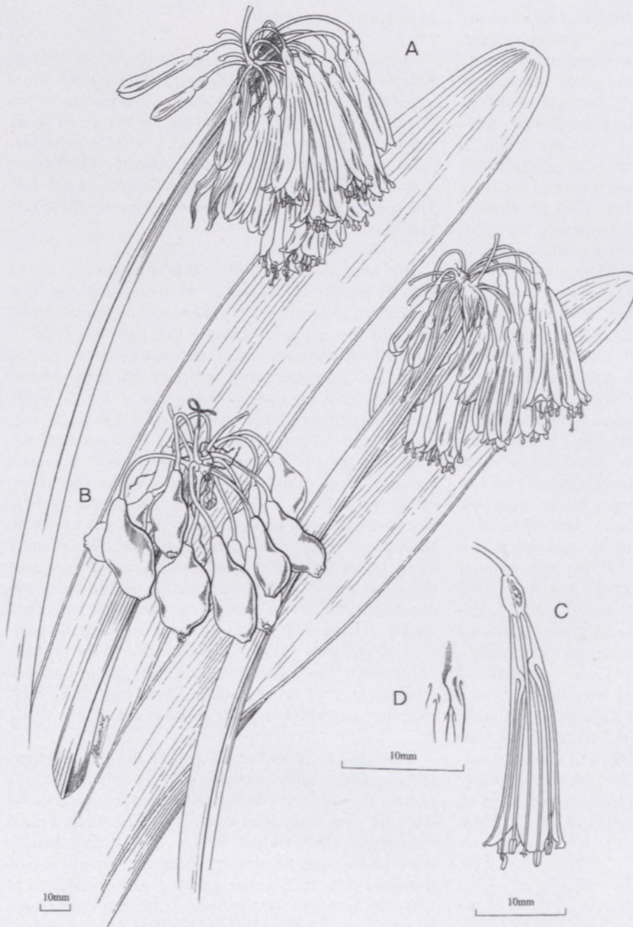
FIGURE 1.— Clivia mirabilis : A, mature inflorescence; B, fruiting head with irregularly shaped berries; C, longitudinal section through flower; note filament bases adpressed to style forming nectar reservoir; D, detail of filament bases. Scale bars: 10 mm. Artist: John Manning.

terranean biomass gives mature plants an extensive water storage capacity, allowing them to survive the prolonged rainless summers of the Oorlogskloof environment.