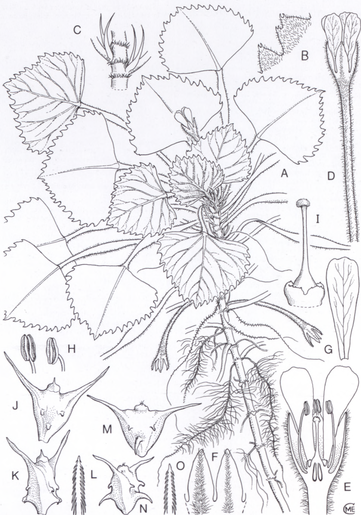
FIGURE 1.—A–L, Trapa natans var. bispinosa : A, habit, \times 0.8 ; B, part of leaf margin, lower surface, \times 3.8 ; C, nodes showing stipules, \times 2.5 ; D, flower, \times 2.5 ; E, l.s. flower, \times 3.8 ; F, two sepals, \times 3.8 ; G, petal, \times 3.8 ; H, anther, two views, \times 7.6 ; I, ovary and disc, \times 7.6 . J–L, fruit: J, endocarp, \times 1.2 ; K, side view, \times 1.2 ; L, apex of horn, \times 2.5 . M–O, fruit of T. natans var. pumila : M, endocarp, \times 1.2 ; N, side view, \times 1.2 ; O, apex of horn, \times 2.5 . A–D, Smith 2987; E–I, Biegel & Gibbs Russell 3714; J, K, Gibbs Russell 2786; L, Ellis 3073; M–O, Wager 37369.