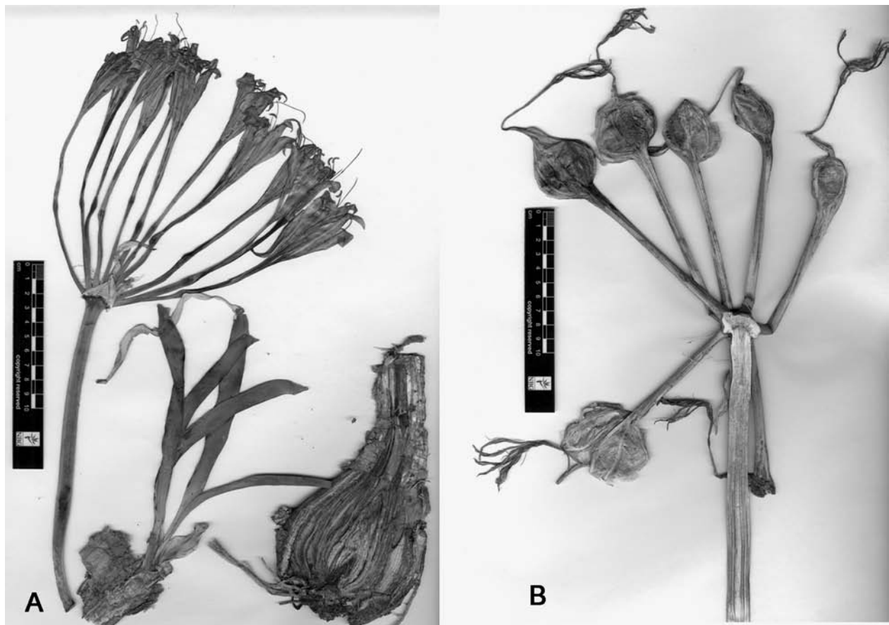
FIGURE 15.— Ammocharis deserticola . A, dried bulb cut in half lengthwise with pressed leaves and pressed inflorescence; B, pressed infructescence cut in half lengthwise. Voucher specimen: H. Kolberg & T. Tholkes HK2998 (NBG). Scale bars: A, B = 100 mm.

average of 50–100 mm, but it is highly erratic and completely rainless years are not uncommon. Minimum temperatures on average are 9–10°C, whereas they reach an average of 32–33°C in the summer months (Mendelsohn et al. 2002). At the type locality, between 300 and 400 plants were visible in February 2011, whereas at two other localities in the same quarter-degree grid, an estimated 100 to 150 plants were seen. Two populations, including the one at the type locality, occur near the Langer Heinrich uranium mine, but are afforded protection by falling within a national park. The third population of up to 100 plants, however, falls within the mine's operational area and the plants there will be endangered. Plans are under way to rescue these and use them in the restoration of mine sites. There are unconfirmed reports of this species occurring also in the quarter-degree grids 2315CA and 2515DA.