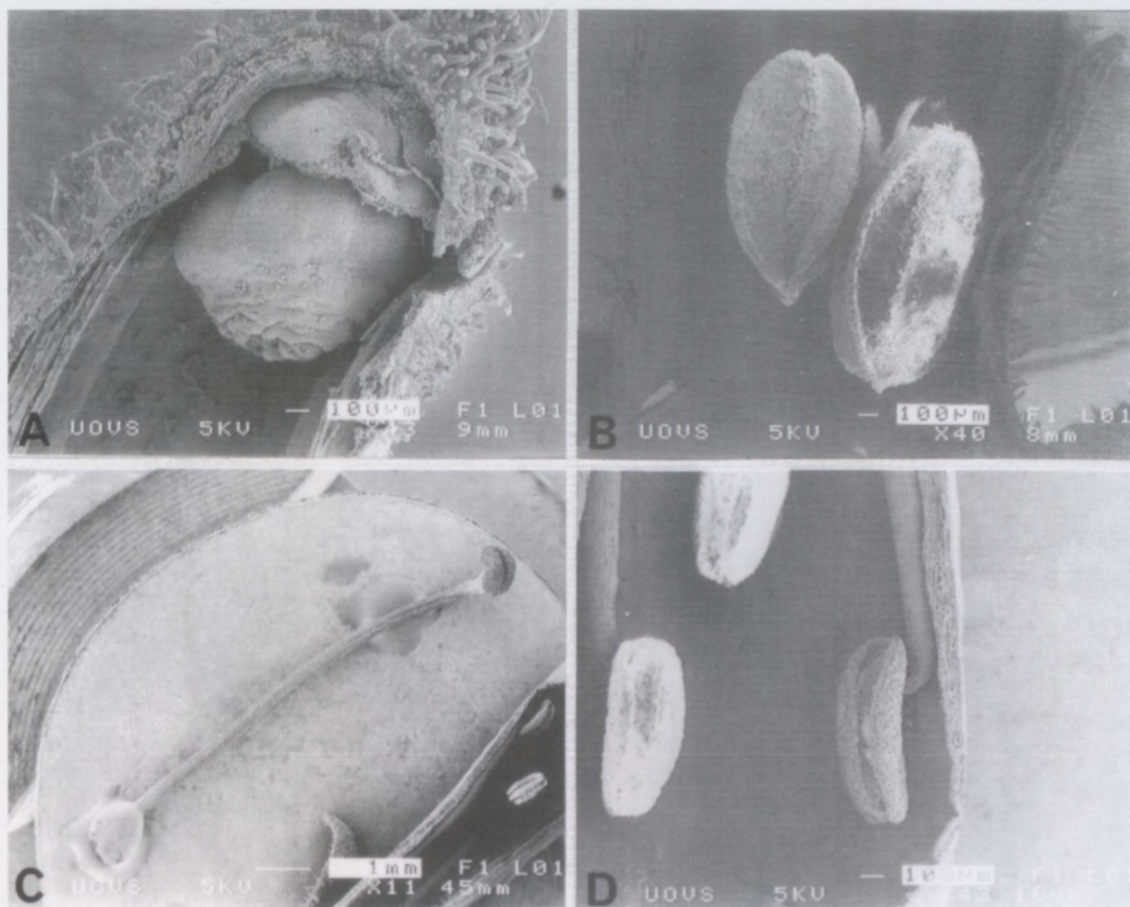
FIGURE 2.—Anthers and ovaries of functionally male and female specimens of Lycium . A, L. villosum , A. Venter 362, ovary of functionally male plant; B, L. villosum , A. Venter 362, anthers of functionally male plant; C, L. villosum , A. Venter 358, pistil of functionally female plant; D, L. villosum , A. Venter 358, anthers of functionally female plant. Scale bars: A, B, D, 100 µm; C, 1 mm.

Cytogenetic studies showed that L. arenicolum and L. tetrandrum display more meiotic abnormalities, such as univalents and bivalents during metaphase, as well as an anaphase bridge in L. tetrandrum , than L. afrum and L. horridum (Minne 1992; Spies et al. 1993). Although polyploidy and meiotic abnormalities occur during microsporogenesis in the anthers of the functionally male plants,