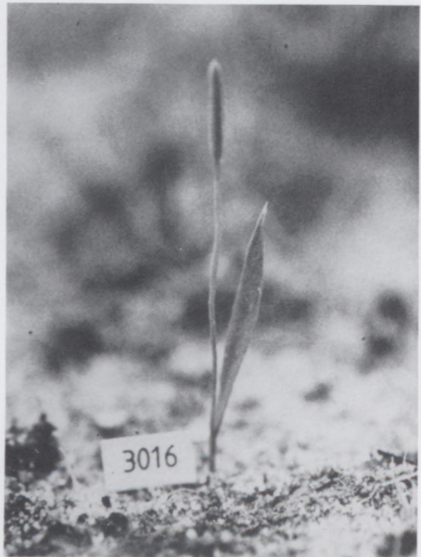
FIGURE 1.— Ophioglossum caroticaule , Burrows 3016, Sengwa Research Area, Zimbabwe.

1.2. Ophioglossum gracillimum Welw. ex Hook. & Bak., Synopsis filicum: 445 (1868); Burrows: 40 (1990); Johns: 8 (1991). Type: Angola, Pungo Andongo, near Catete, Jan. 1857, Welwitsch 36 (BM, lecto!; K!, LISU, iso.).