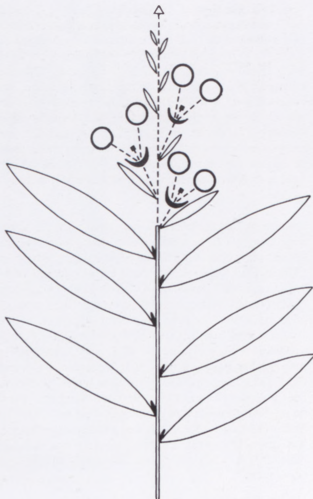
FIGURE 9. — Diagram of the structure of a synflorescence in Priestleya boucheri consisting of three two-flowered florescences on lateral, non-innovating brachyblasts—dotted lines represent extended axes.

Chemical analyses of samples from both populations on the Kogelberg clearly indicate that this species contains alkaloids characteristic of Priestleya sens. str. and Liparia parva and none of the unique compounds found in Xiphotheca (Van Wyk et al. 1991). The new species has large amounts of quinolizidine alkaloids such as sparteine, 11,12-dehydrosparteine, lupanine, isolupanine and 13-hydroxylupanine. The relative quantities of these alkaloids are closely similar to the combinations found in other species of Priestleya (virtually identical to that found in P. latifolia , for example). Liparia splendens differs from L. parva in the much higher proportion of ammodendrine, but otherwise the alkaloids of Liparia are similar to those found in Priestleya . In contrast, Priestleya section Anisotheca (= Xiphotheca ) has a unique combination of alkaloids not found in Priestleya sens. str. , i.e. anabasine